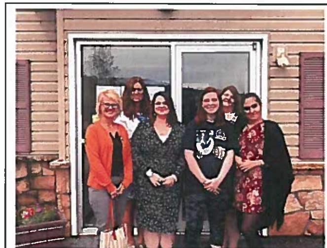
TANF State Monitoring Initiative, August 28, 2019, the group had the opportunity to tour/meet with the SPCA Clearfield and the MoShannon Valley YMCA worksites in our region.