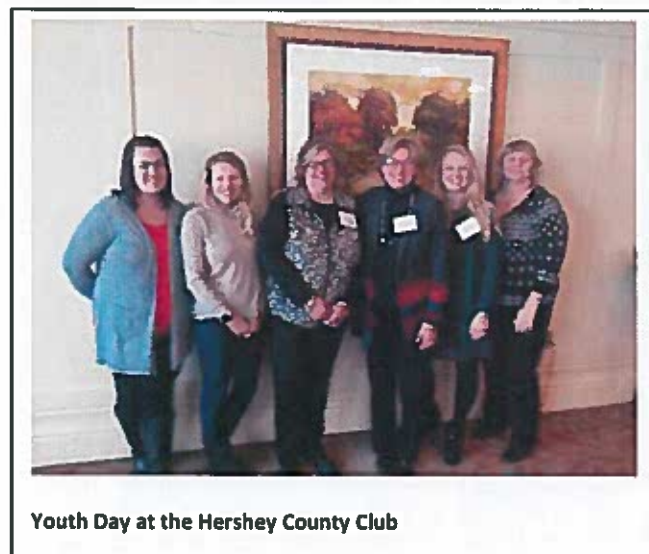
Youth Day at the Hershey County Club