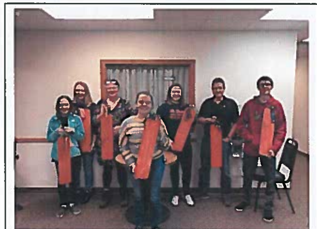
PA CareerLink Clearfield County at Clearfield Connection Café TANF and OSY customers enjoy a crafting event. The customers enjoyed hot cocoa, snacks and sharing program stories and plans for the future.