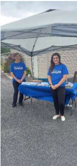
Figure 9 DuBois PA CL Staff