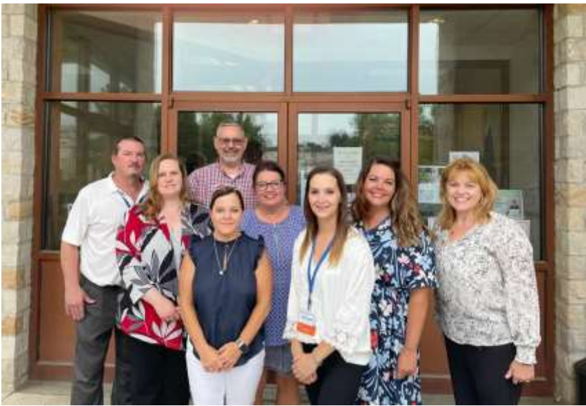
Figure 7 Elk County PA CL Staff with Senator Dush