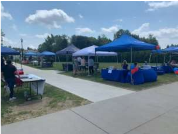
Figure 8 Elk County PA CL Staff Setting Up for PA CL Day