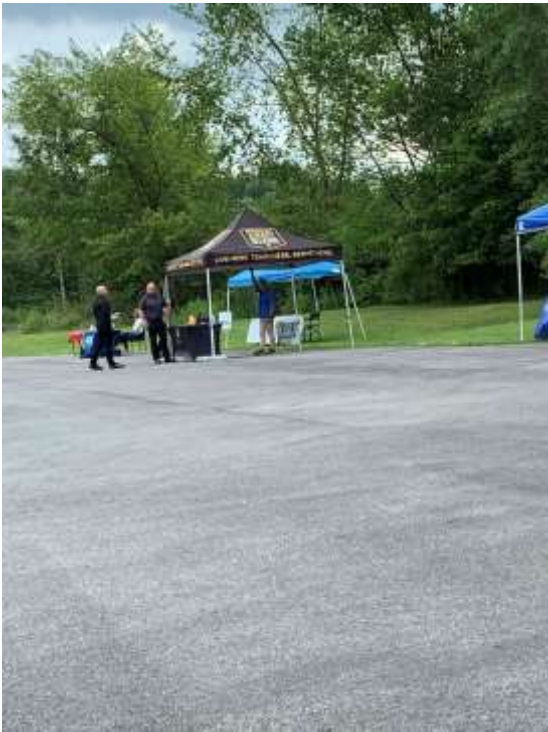
Figure 6 DuBois Job Fair