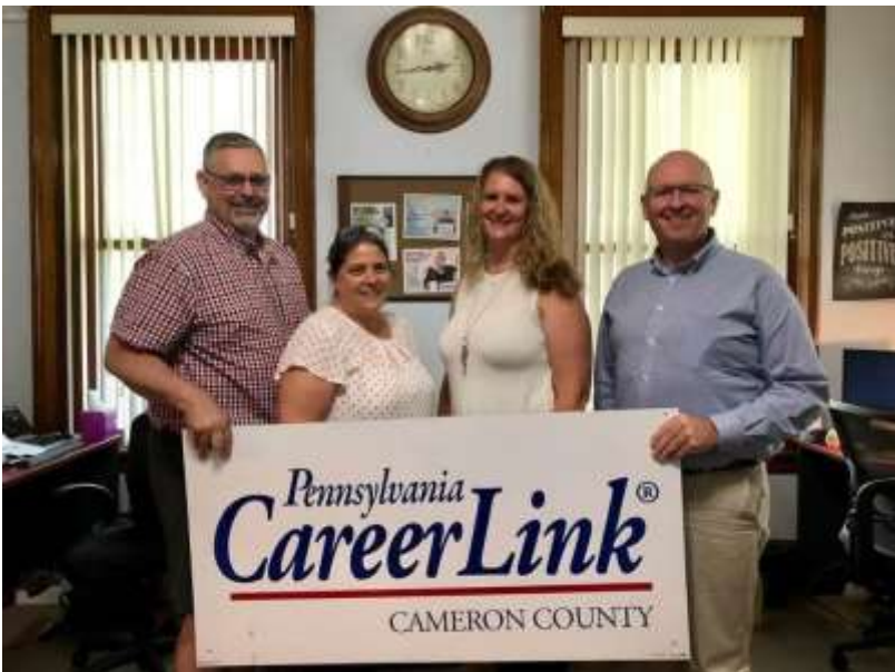
Figure 4 Senator Dush and Rep. Causer visit the PA CL in Cameron County